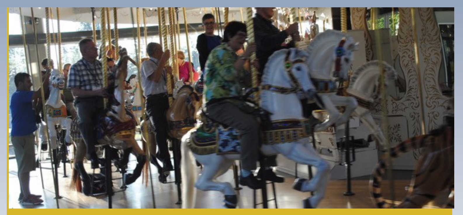
ABOVE: Fun at Looff Carrousel

JULY 25-27, 2019, THE CENTENNIAL HOTEL, SPOKANE, WA