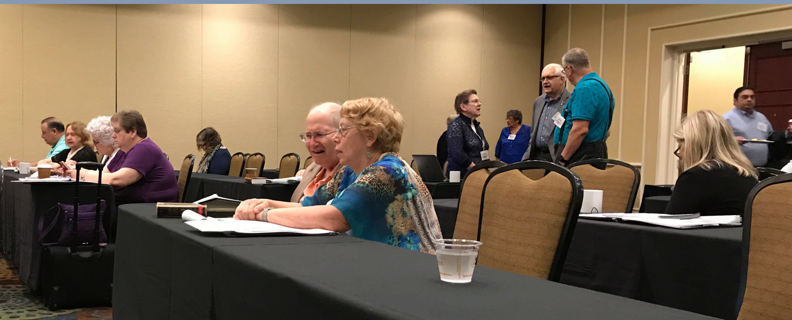
AIP Annual Session delegates enjoy a short break between sessions.