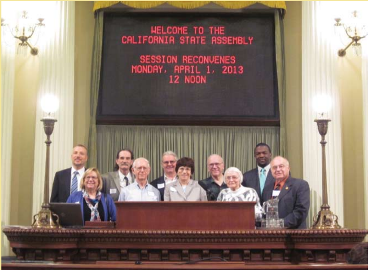
Photo of Speakers Rostrum: AIP Chapter 71 members at the Speaker's rostrum in the Assembly Chamber.