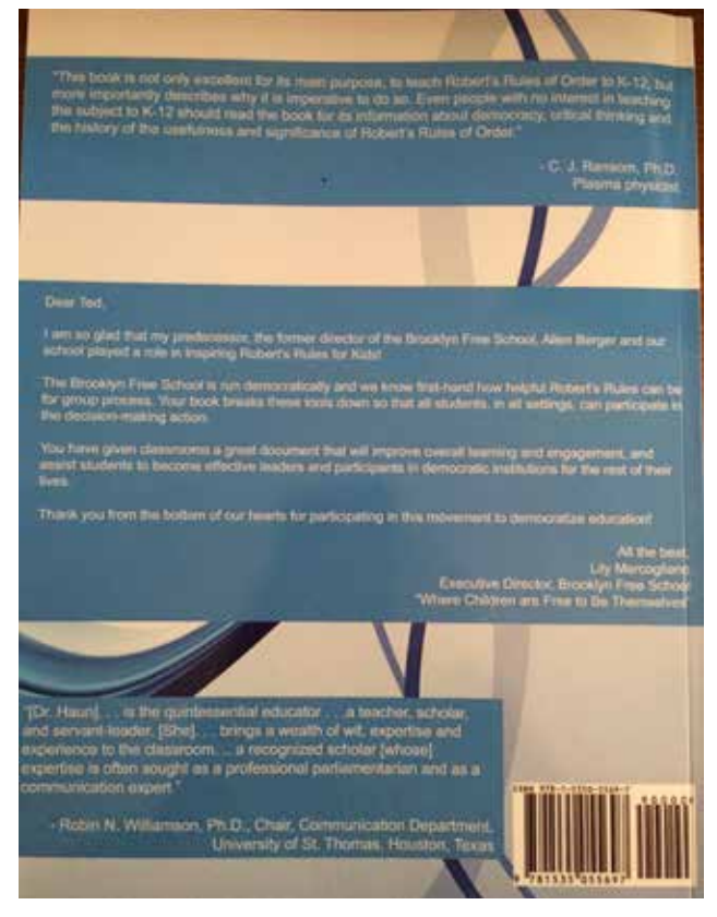
Now Available on Amazon.com